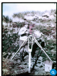
Frank Hurley with a cinematograph, an early movie camera, on South Georgia