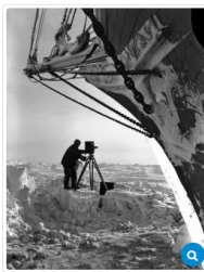
Frank Hurley under the bow of the Endurance in 1915