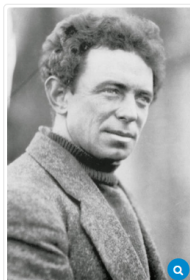
Frank Hurley in 1914